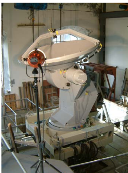
The antenna (including pedestal) during full-scale tests