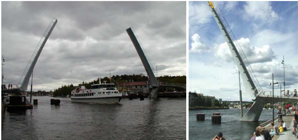
The bridge in open position