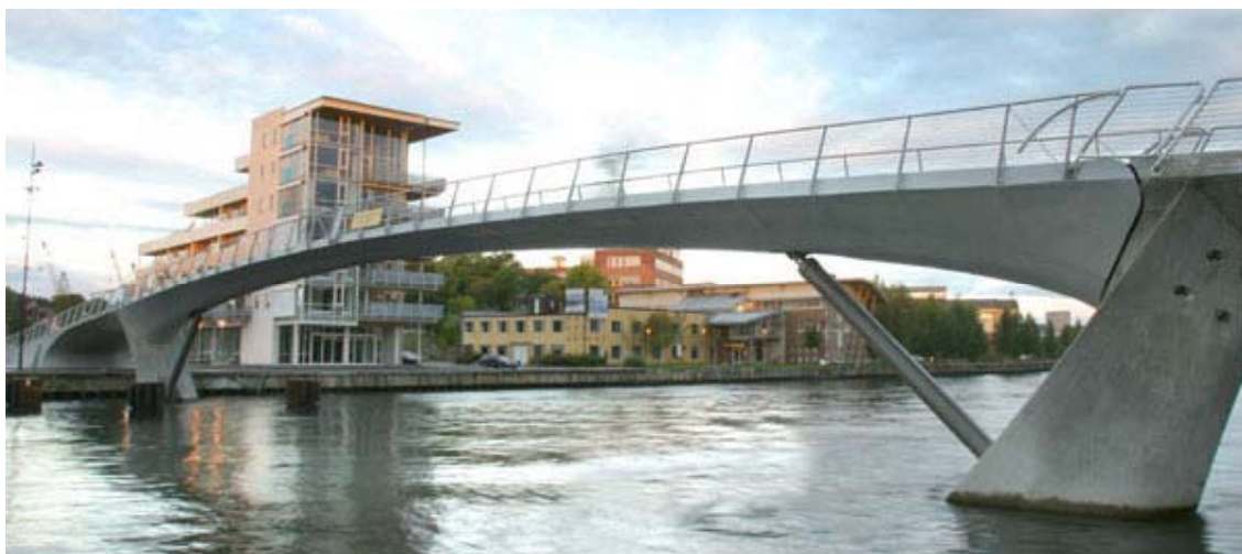
Bridge seen from the main square side in Fredrikstad, Norway

The footbridge, crossing the river Vesterelven in Fredrikstad, is a double-leaf bascule bridge without counterweights. It is the largest moveable bridge in Scandinavia using FRP composites as the main load carrying materials. One large hydraulic cylinder helps each of the 28m long leaves to move up and down. The leaves are built as a closed box girder with longitudinal and transverse stiffeners inside, with double curved outer surfaces. Approx. weight of a fully equipped leaf is 20ton, where 9ton is FRP composite materials. The bridge deck is a sandwich construction with carbon fibre (CFRP) laminates and a Balsa core, with embedded heating cables for defrosting during the wintertime. The deck is strong enough to carry a car with up to 2.0ton axel load. The bottom flange of the girder is made of single skin CFRP laminates (10-38mm thick). The internal stiffeners are all sandwich constructions with CFRP and/or GRP laminates and PVC core materials. A steel construction inside the thickest end of the girder is used to distribute the concentrated bearing loads into the composite box girder. Finally, the side panels are made semi- translucent by using a bluish and translucent polyester provided by Reichhold AS, and a custom made internal light system mounted inside the hollow girder. All, except the translucent side panels, which is wet lay-up, where made by vacuum assisted resin infusion.