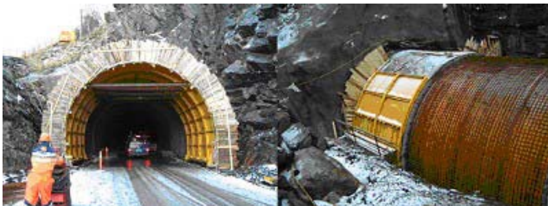
GRP Shuttering in use