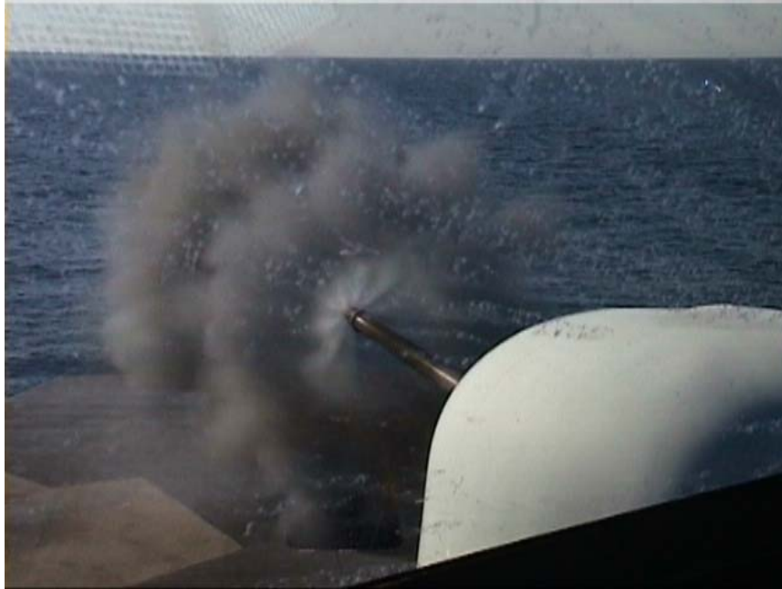
Gun blast testing on mock up