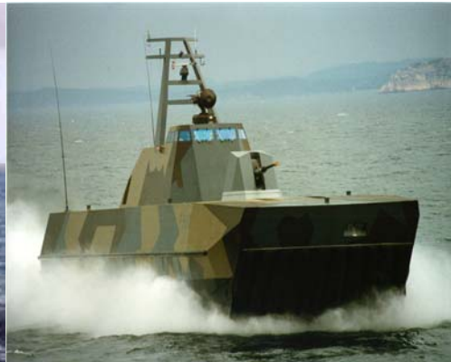
Skjold with gun near Korsnes