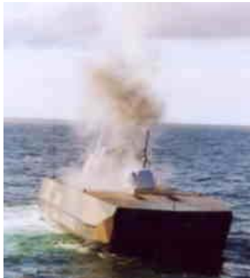
From full scale gun testing